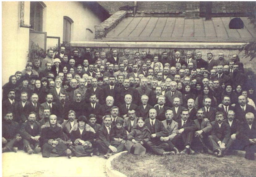
Delegates to the All-Ukrainian Baptist Union, Odessa, November 1925