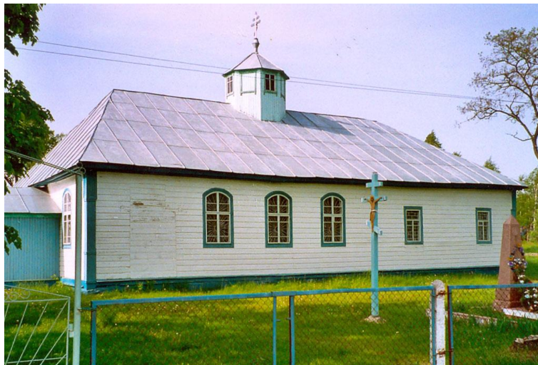
Horstschick Church built in the early 1900s. Photo 1993

The German Baptist movement in Volhynia, Russia (Ukraine) began in 1858/1859 with the influx of a small, but steady stream of German colonists from Poland. They came largely in search of new economic opportunities and in order to escape religious persecution. Immediately upon arrival they met for worship in the deep primeval forests of Volhynia under the open skies. It was not, however, until 1861, with the emancipation of the Russian serfs, that colonists from Poland and East Prussia began to flood into Volhynia in large numbers, bringing with them their newly-found religious faith and beliefs. Three years later, on May 22, 1864, the first German Baptist church in Volhynia was officially organized in Horstschick with 203 members.