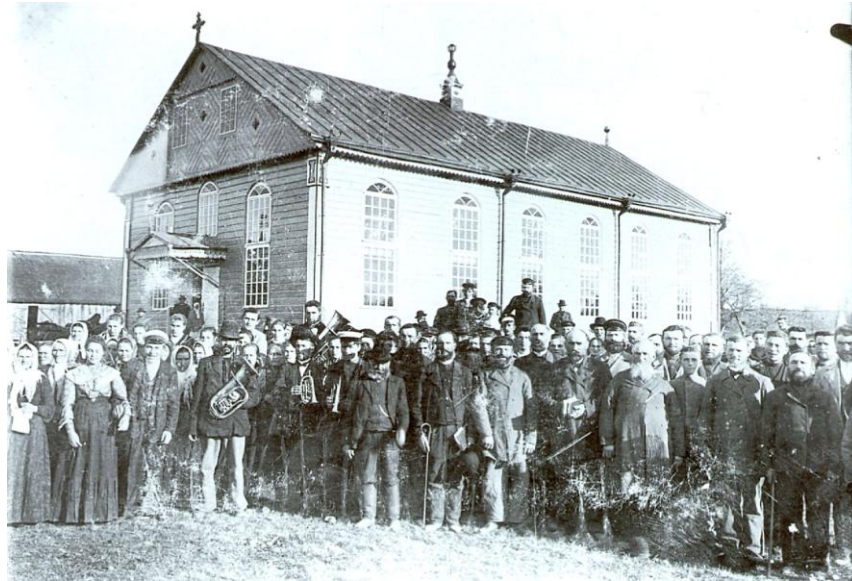
Sorotschin Church built in 1906-1910, still standing. Photo 1920

When the Tsar freed the serfs in 1861, many large Polish estates in Volhynia became available to German farmers from East Prussia as well as Poland. Consequently, a group of Masurs (Germans who spoke a Polish dialect) from the southern part of East Prussia took immediate steps to explore the possibility of resettling to the area. A committee was sent to investigate. When the committee reported in favor of resettlement, the necessary funds were raised and two large estates were purchased from the Polish landlords.